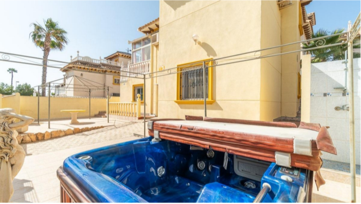
PLAYA LA ZENIA